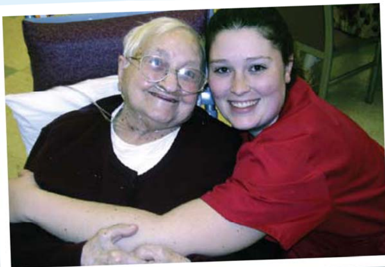
▲ Funds restricted to the Retirement Fund help support our sisters in the later years of their lives like those who reside at Assisi House in Aston, Pennsylvania, and at St. Ann's in Tacoma, Washington.